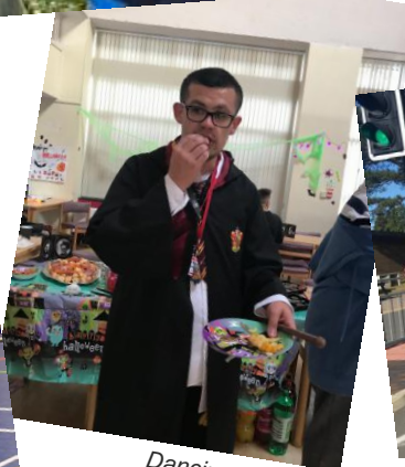
Dancing for Dignity