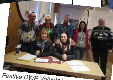
Festive DWP Volunteers