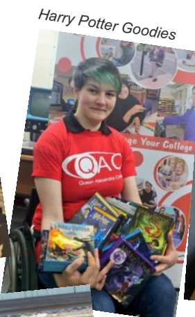
Harry Potter Goodies