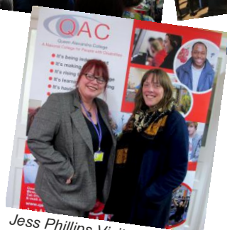
Jess Phillips Visits