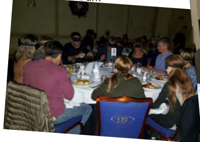
Dinner in the Dark