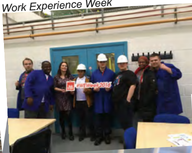
Work Experience Week

The week was a great success with lots of positive feedback from both employers and students and is something we look forward to running again. We would like to take this opportunity to thank all of the employers we worked with for help making it such a success!