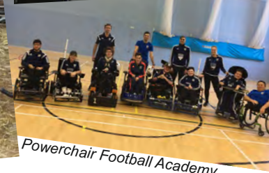
Powerchair Football Academy