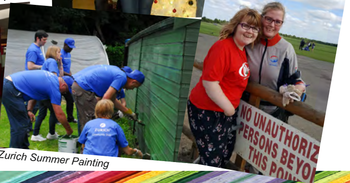
Zurich Summer Painting