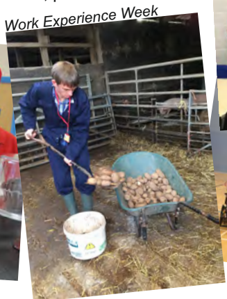
Work Experience Week