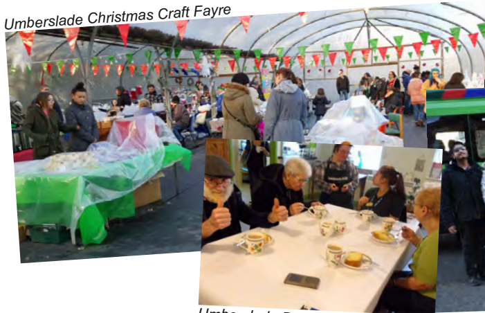
Umberslade Dementia Groups