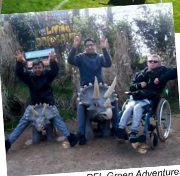
PFL Green Adventures