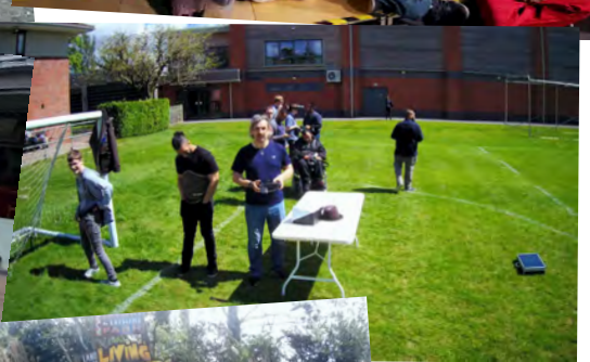
Outdoor Classroom Day Fun