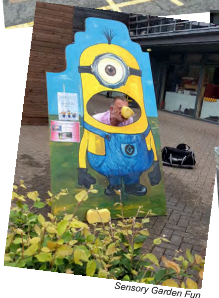
Sensory Garden Fun

PFL Green were out and about making the most of sunny days when they went to the Safari Park (with students loving the dinosaur exhibit and giant gorilla!) and then playing crazy scientists at the MAD Museum in Stratford, following their Dragons' Den presentation.