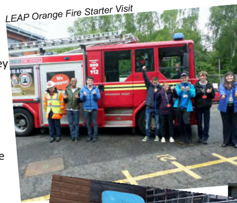
LEAP Orange Fire Starter Visit

Blue Watch, our friends from Woodgate Valley Fire Station, brought one of their engines to College, giving students the opportunity to explore a real working Fire Engine. The crew also gave a fire safety talk to students, but were unfortunately called out mid presentation, leaving with the sirens and blue lights flashing, much to the students' excitement!