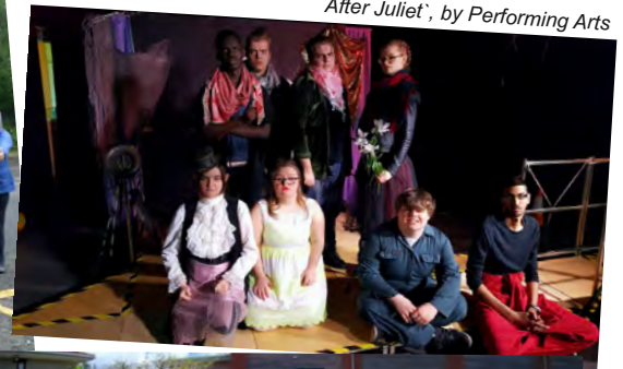
'After Juliet', by Performing Arts

The Performing Arts Spring production was 'After Juliet' written by Sharman Macdonald. Students had worked hard rehearsing since January, with the final performances involving acting, dance and physical theatre. The hard work of cast and crew paid off with audiences loving the show. Well done everyone!