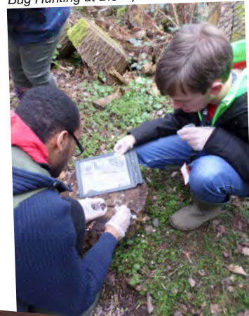
Bug Hunting at Bishops Wood