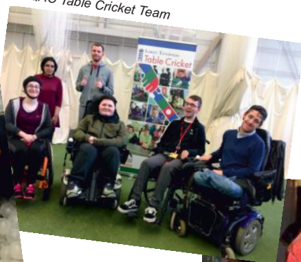
QAC Table Cricket Team