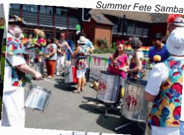
Summer Fete Samba