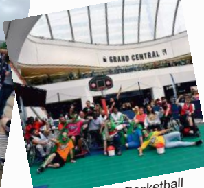
Grand Central Basketball