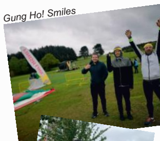
Gung Ho! Smiles