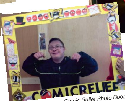
Comic Relief Photo Booth