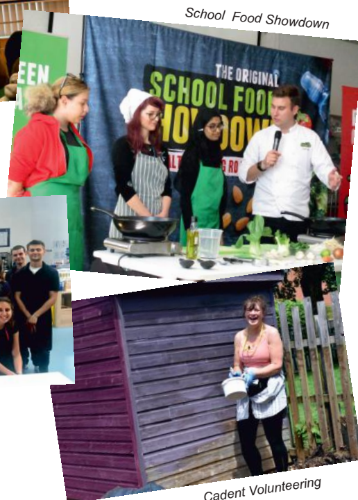
School Food Showdown