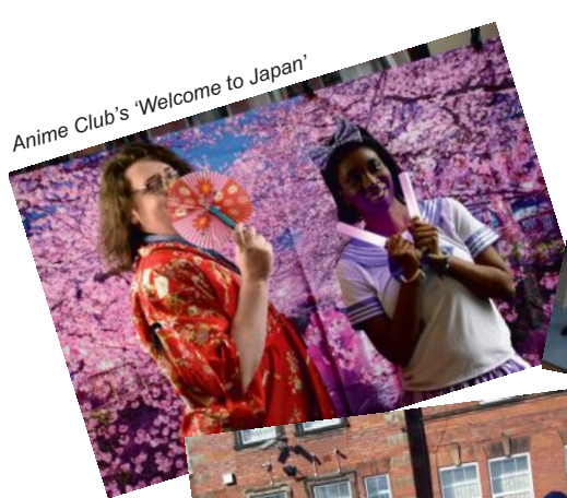
Anime Club's 'Welcome to Japan'