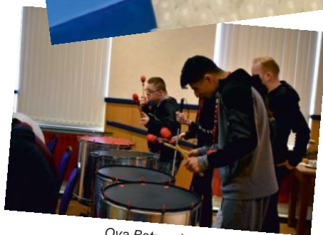
Oya Batucada Samba Workshop