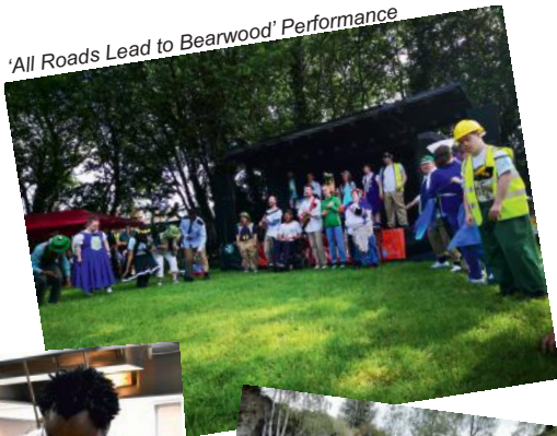
'All Roads Lead to Bearwood' Performance