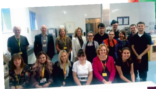
Volunteers Week Celebration