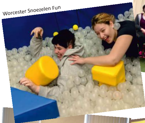
Worcester Snoezelen Fun