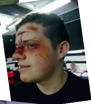
Special Effects Gore