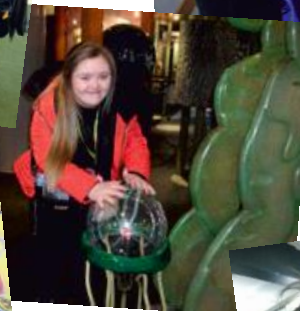
Fun at Conkers