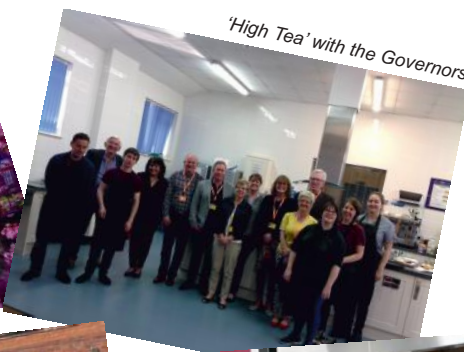
'High Tea' with the Governors