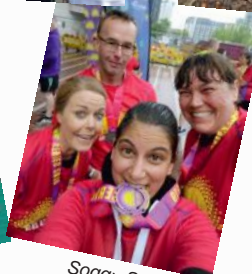
Soggy Sunrise 5k