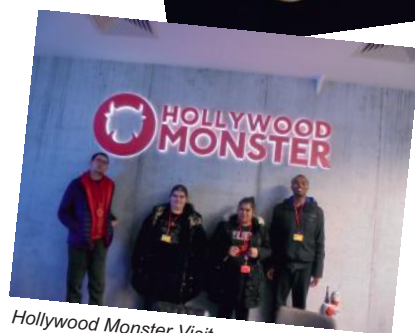
Hollywood Monster Visit

A group of UCB Level 2 Media students joined our Performing Arts group for a 'Special Effects' masterclass, showing how to apply special effects make up before transforming students with broken noses, cuts, scrapes, bruises and plenty of gore.