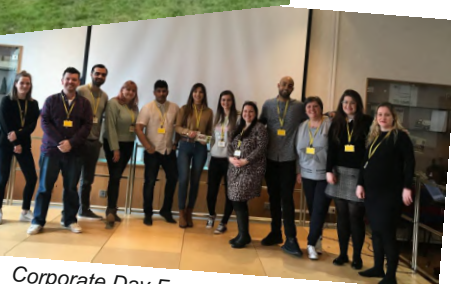
Corporate Day Fun