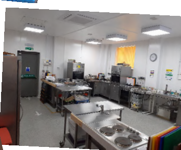
New Hospitality Teaching Spaces