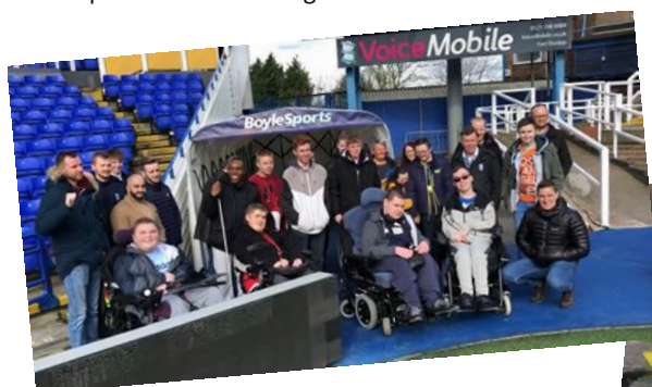
A Trip to 'The Blues'

It was a great day for everyone, sharing in their love of football and experiences as fans, topped off with the students being given complimentary tickets for a future game. A big thank you to everyone at St. Andrews for making the visit possible and making us feel so welcome.