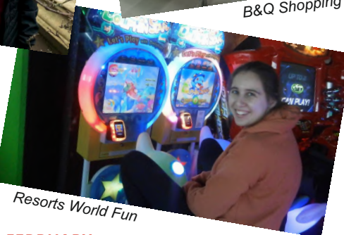
Resorts World Fun

Thanks to our friends at CBSO, a group of students were able to attend a relaxed performance of The Wizard of Oz, featuring a 10-piece CBSO ensemble and script specially designed for students with special educational needs. Students joined characters on a magical, musical journey through imaginary worlds, with opportunities to engage with the performance throughout.