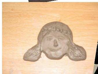
Creative Clay Creations