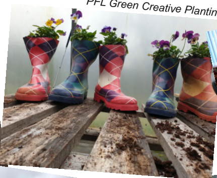
PFL Green Creative Planting