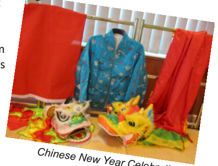
Chinese New Year Celebrations