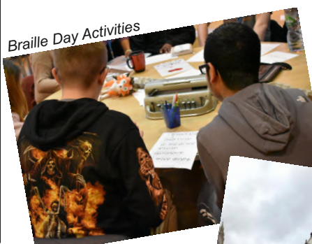
Braille Day Activities