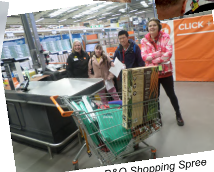
B&Q Shopping Spree