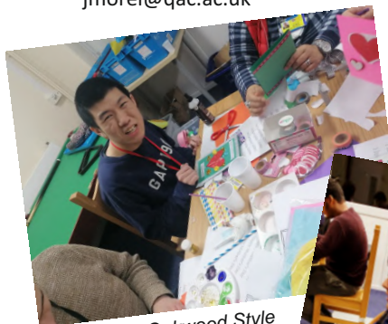
Fun Times, Oakwood Style