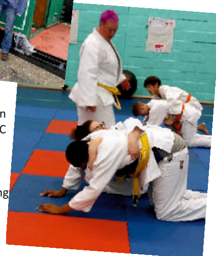
Sport Relief Judo

delivered by a number of athlete mentors. The aim of the event was to equip young volunteers with the skills to promote participation in sport, challenging perceptions around disability and creating inclusive provisions in their home cities.