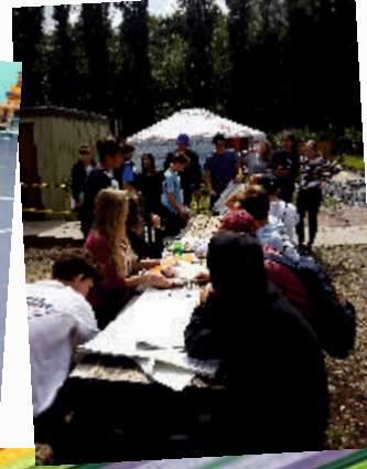
Wellington College Pupils