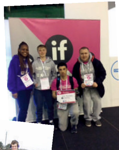
Sport Students Volunteering

Sport students travelled to Loughborough University, in order to take part in the Inclusive Futures Camp, delivered by Youth Sport Trust. They were joined by other volunteers and took part in a range of sessions and workshops,