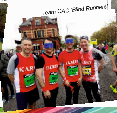
Team QAC 'Blind Runners'