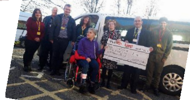
The West Brom