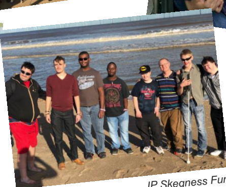
IP Skegness Fun