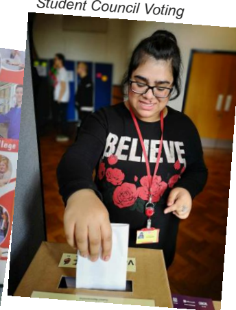
Student Council Voting