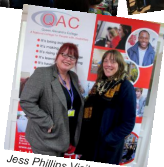
Jess Phillips Visits