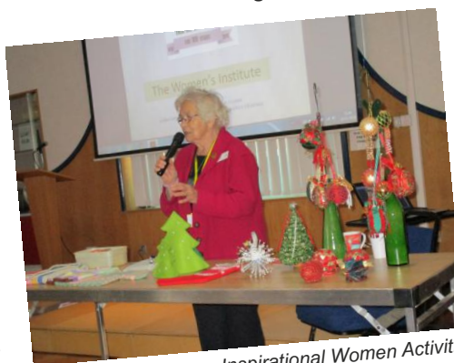
Inspirational Women Activities

After Christmas, we are looking forward to local visits and the culmination of the project - an exhibition of displays and an Inspirational Women Parade featuring students in costume.