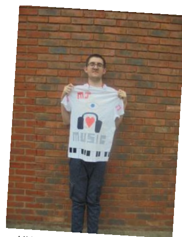
HUB Creative Creations

The group have settled really well and have already designed their own t-shirts, produced bespoke signs for the Trades Department and created personalised items for the Christmas Fayre.