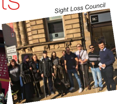
Sight Loss Council