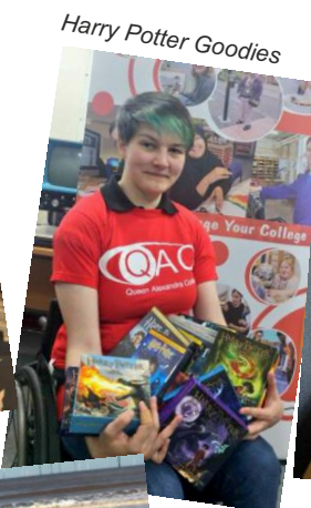
Harry Potter Goodies