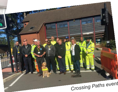
Crossing Paths event

It was a really insightful exercise, with many of the Amey employees saying that the experience had highlighted issues faced by disabled people when they encountered unexpected obstructions and they would factor this into their work in the future.