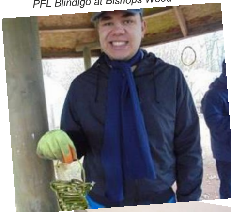
PFL Blindigo at Bishops Wood

This was a tremendous event and encouraged everyone to come together to work collectively for a great cause, whilst having lots of fun! It also took some students out of their comfort zones, a challenge they more than rose to, so much so it has inspired them to organise many more exceptional parties!