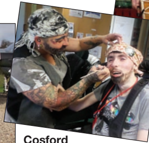
Cosford Air Museum