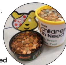
Children in Need

On 28th November the BTEC Performing Arts group visited The Blue Orange Theatre to watch the production: 1914 Local News. The Tell Tale Theatre Company production gave the audience a glimpse of the lives of those who lived through the dark days of war with some real stories from the exact day back in 1914 being told. Students thoroughly enjoyed the show and worked hard to raise money for the trip selling raffle tickets around College earlier in the month.