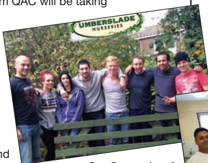
Co-Operative & Barclays Teams