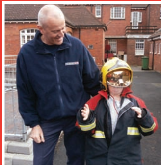
Work Experience Week