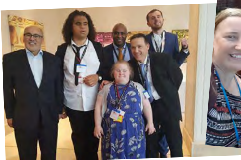
Judo GNO Presentation

In May, representatives from the club were invited to a presentation lunch, hosted by the Gentlemen's Night Out charity. We were delighted to attend and hear inspirational stories of individuals and groups they support, and were humbled to be one of the chosen charities presented with a £1500 cheque.