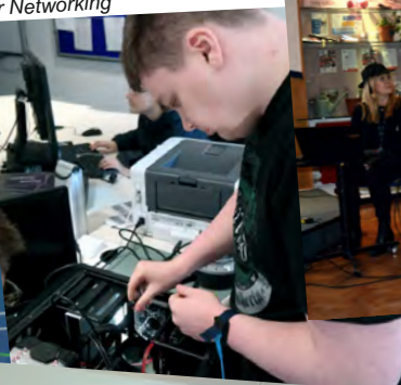
IT Computer Networking