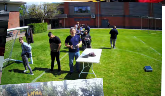
Outdoor Classroom Day Fun