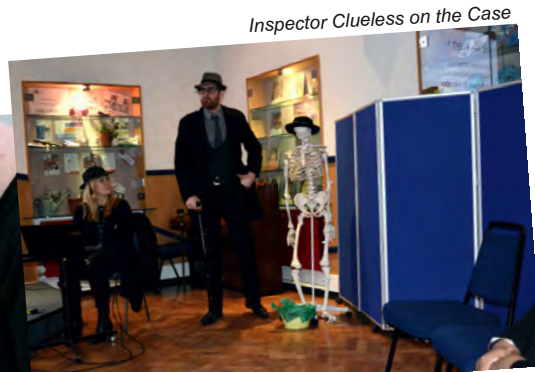
Inspector Clueless on the Case