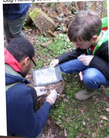
Bug Hunting at Bishops Wood