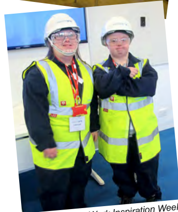
Work Inspiration Week

World Water Day takes place in March and this year's theme was 'Wastewater'. A representative from Severn Trent Water visited QAC to run workshops for students focussing on advocating sustainable management of freshwater resources. The groups took part in tactile, interactive workshops using props and language that outlined what happened to our water once it entered the sewers.