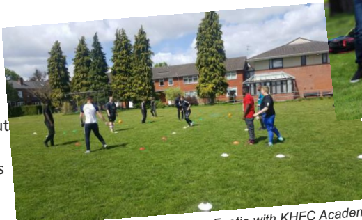
Footie with KHFC Academy