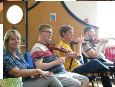
Strings Club visit