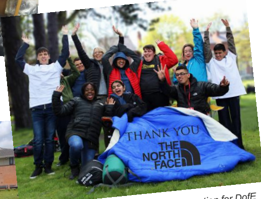
The North Face donation for DofE