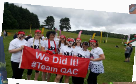
Team QAC goes Gung-Ho!