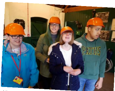
History lessons with PFL Green