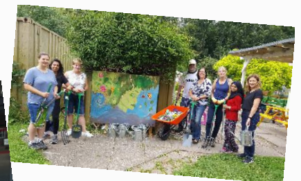
Artistic RBS volunteering