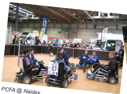
PCFA @ Naidex

Our PCFA students were busy again, this time joining The Albion Foundation at the Naidex exhibition to present their powerchair football prowess. They worked together to demonstrate games and various powerchair football skills, allowing people to learn more about our innovative course and Powerchair Football in general.