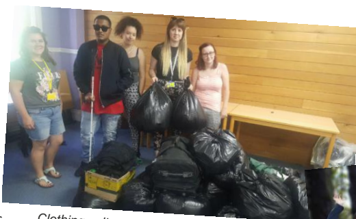
Clothing collection for the homeless