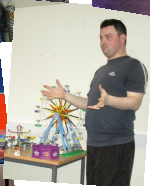
Lego Show & Tell